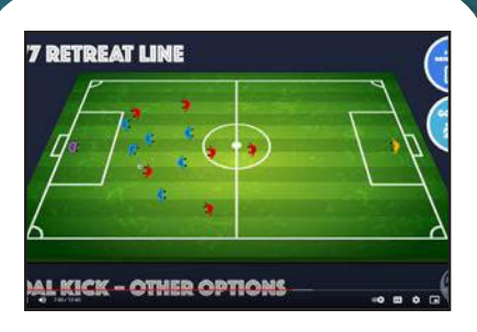
Soccer Retreat Line Explained for 7v7 and 9v9