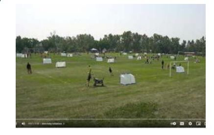
U10 - U12 Initiatives to Prevent Lopsided Matches