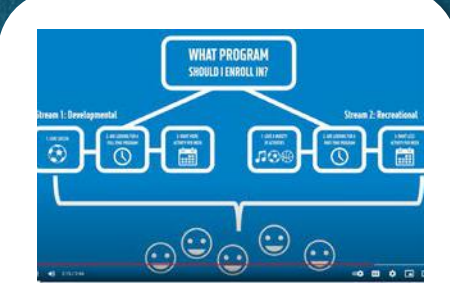
Developmental VS Recreational Programming